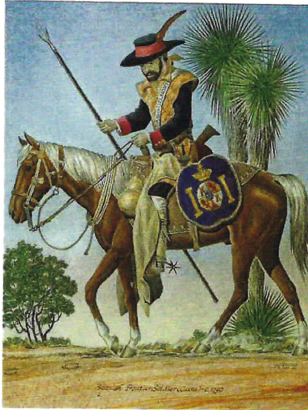
Soldado de Cuera circa 1790